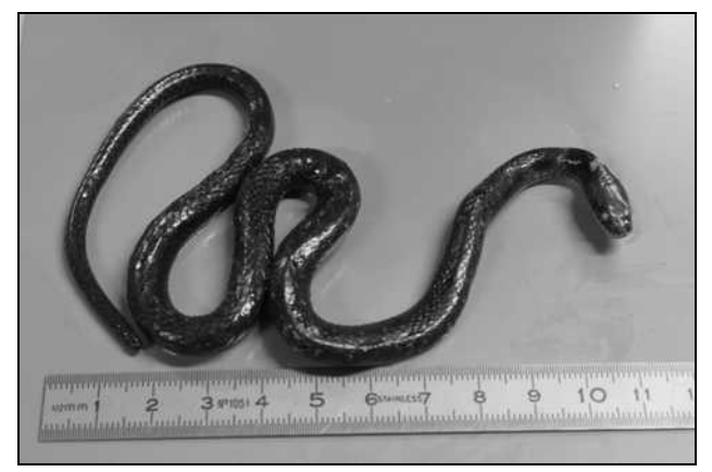
Figure 13 . Preserved adult male Natriciteres fuliginoides (RMCA R.28316) from Oyem, Woleu-Ntem Prov., northern Gabon.

tioned by Hughes (2017) and identified by him as a Natriciteres variegata: RBINS 3765, from "Ibembo, Uele, Congo Belge ["Belgian Congo," now Democratic Republic of Congo]." The only morphological characteristics provided by Hughes (2017) for this specimen are: presence of a neck band, incomplete tail, and 'no more than 15 body scale rows'. It shows a SVL of 243 mm, a tail length > 36 mm (tail incomplete, healed), a round pupil, 2 internasals, 2 prefrontals, 8/8 supralabials of which the 4th and 5th contact the orbit, 9/8 infralabials of which the first four on each side contact the anterior sublinguals, 1/1 loreal, 2/2 preoculars, 3/3 postoculars, 0/0 subocular, 1/1 supraocular, 1+2 /1+2 temporals, 3 preventrals + 130 ventrals, a divided anal scale, > 22 divided subcaudals, and 15-15-15 smooth dorsal scale rows with a non-enlarged vertebral row. Contrary to the specimen RMCA R.28316, this individual agrees in all respects with the definition of N. variegata.