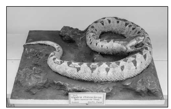
Figure 15 . Stuffed adult Bitis nasicornis (MZL 1342) from Gabon exhibited in the Museum of Zoology in Lausanne, Switzerland.

Bitis gabonica (Duméril, Bibron & Duméril, 1854) MZL 1340 (whole stuffed specimen): "Gabon." This individual was given in 1964 to the MZL by the former director of the Vivarium de Lausanne (Lausanne Vivarium). Unfortunately no precise locality is available. It was repainted based on its colors in life (Figure 14), and the two black suborbital triangles which allow to easily distinguish B. gabonica from the West African Bitis rhinoceros (Schlegel, 1855). are well visible.