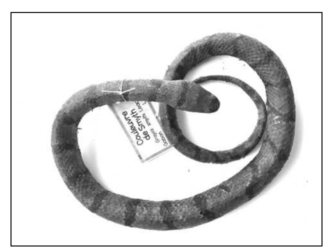
Figure 7. Stuffed Grayia ornata from Gabon exhibited in the Museum of Zoology in Lausanne, Switzerland.