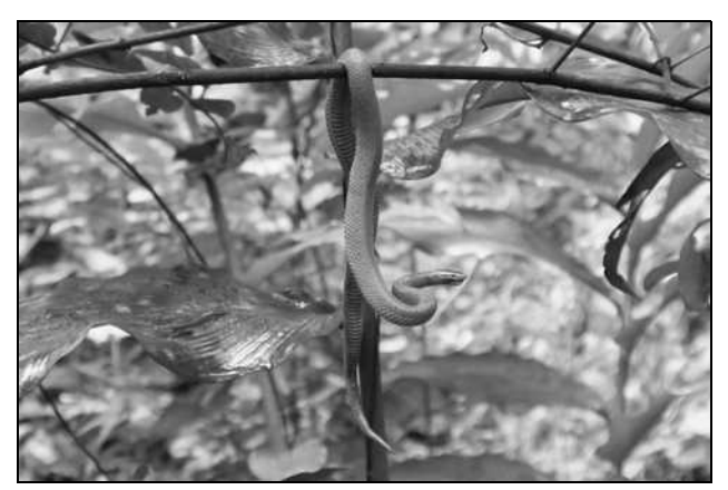
Figure 11 . Live adult Lycophidion laterale from southern Ivindo NP, Ogooué-Lolo Prov. The snake, found on the ground, was placed on the tree for the photograph.

Pauwels and Sallé (2009) analyzed the existing records of Natriciteres variegata (Peters, 1861) from Gabon. Since no voucher specimens undoubtedly originating from Gabon could be traced, they concluded that there was not enough evidence to include this snake in the country's herpetofaunal list. Hughes