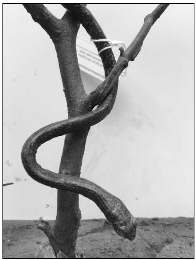
Figure 8. Stuffed adult Hapsidophrys smaragdinus from Gabon (MZL 28698) exhibited in the Museum of Zoology in Lausanne, Switzerland.

vided subcaudals. Dissection of its stomach revealed a small legless skink (MSNS 259; Figure 10). The skink's SVL is difficult to determine, as the body is broken into two parts behind the neck, the sum of both parts being approximately 56 mm (but possibly a small body fraction is missing); its tail length is 17 mm; it has two supranasals and 22 smooth dorsal scale rows around midbody; its ocular scale is in contact with the 3rd supralabial. Both Lycophidion laterale and Feylinia currori were already recorded from Ipassa (Carlino and Pauwels, 2015), but this skink represents a new prey record for this snake.