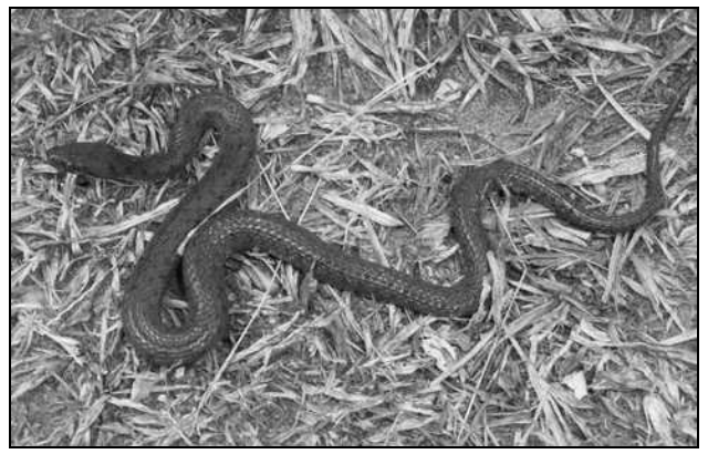
Figure 12. Live young Hydraethiops melanogaster in Arboretum Raponda Walker, Estuaire Prov.