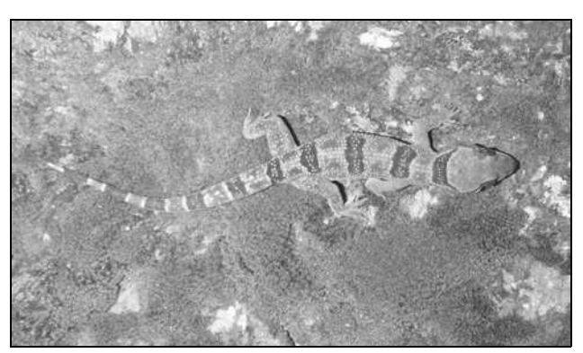
Figure 4. Live adult male Hemidactylus fasciatus (MSNS 260) in Arboretum Raponda Walker, Estuaire Prov., northwestern Gabon.

MSNS 262: Arboretum Raponda Walker (ca. 0°35'41.2"N, 9°20'10.1"E), Komo-Mondah Dept, Estuaire Prov., 15 April 2017. Adult male. SVL 52 mm, tail length 45 mm (only first 15 mm original). Pupil vertical. A vertical suture, beginning above, dividing the rostral for two-thirds of its height. Rostral surrounded laterally by 1st supralabial and nasals, and dorsally by two internasals and a scale between the internasals. Differentiated supralabials 11/12; differentiated supralabials from rostral till mid-orbital position 10/10. Infralabials 10/10. Twelve tubercle rows across dorsum between ventrolateral skin folds: the folds poorly marked and showing scattered pointed tubercles. Some pointed scales on the sides of the original part of the tail. Precloacal scales enlarged, including a series of four pored scales on the left side separated by a single poreless scale from a series of four pored scales on the right side; no femoral pores. Scales under original part of tail larger than supracaudals but not