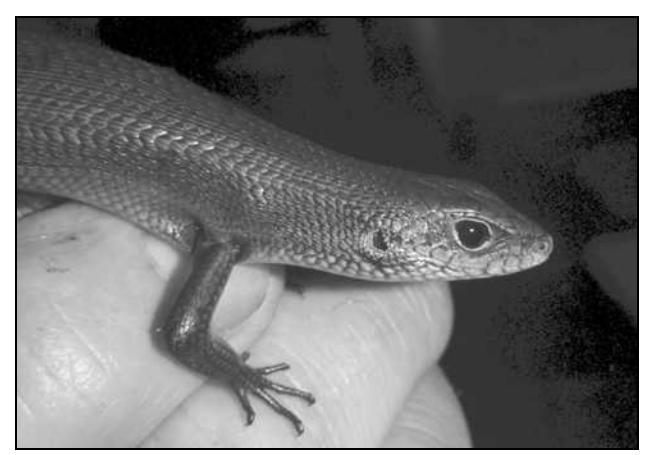
Figure 5 . Live adult female Trachylepis albilabris (MSNS 261) in Arboretum Raponda Walker, Estuaire Prov., northwestern Gabon.

forming transverse plates. Digits unwebbed. Found active at 21:00 on a leaf 80 cm above the ground in forest. Bit repeatedly when caught. New record for the Arboretum (Pauwels, 2016).