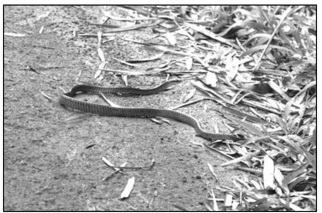
Figure 9. Live adult Rhamnophis a. aethiopissa in Crystal Mounts, Estuaire Prov.

logging road, one of us (LR) photographed an adult individual between the Chutes de la Djidji (Djidji Falls, ca. 0°01'46.4"N, 12°26'40.2"E) and Massouna 2000 (ca. 0°08'45.4"N, 12°31'27.4"E), in the western part of Ivindo NP, in the Lopé Dept of Ogooué-Ivindo Prov. (Figure 11). It was crossing the laterite road in secondary forest. It showed the characteristic stout body with a depressed head and a short tail, light lateral stripes on the head, uniformly brown body (dorsally and ventrally) with paravertebral lines of black dots, 17 smooth dorsal scale rows at midbody, a single anal scale and divided subcaudals. New dept record (Pauwels and Vande weghe, 2008).