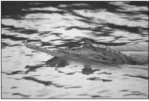
Figure 1. Live Mecistops cataphractus photographed in Loango NP, Ogooué-Maritime Prov., southwestern Gabon. Note the large missing part of the snout.