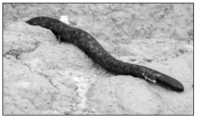
Figure 6. Posterior body of a live adult Calabaria reinhardtii near Ndènguilila, Nyanga Prov.

On 11 June 2016 one of us (AB) encountered by day an adult specimen near Ndènguilila (ca. 2°39'20.8"S, 11°10'46.4"E) on the N.6 Road between Tchibanga and Ndendé, Doutsila Dept, Nyanga Prov. (Figure 6). New dept record (Pauwels and Vande weghe, 2008; Pauwels, Carlino et al., 2017; Pauwels, Chirio et al., 2017).