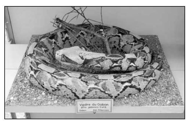
Figure 14 . Stuffed adult Bitis gabonica (MZL 1340) from Gabon exhibited in the Museum of Zoology in Lausanne, Switzerland.

For comparison, OSGP examined another specimen men-