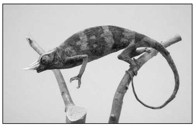
Figure 3 . Stuffed adult male Chamaeleo owenii from Gabon exhibited in the Museum of Zoology in Lausanne, Switzerland.

MSNS 260: Arboretum Raponda Walker (ca. 0°35'41.2"N, 9°20'10.1"E), Komo-Mondah Dept, Estuaire Prov., 17 April 2017. Adult male (Figure 4). Snout–vent length (SVL) 73 mm; tail length 90 mm (tail original). Pupil vertical. Rostral divided from above for two-thirds of its height by a vertical suture; rostral surrounded on each side by 1st supralabial, nostril, the two enlarged internasals and three small scales separating the internasals. Differentiated supralabials 12/11; differentiated supralabials from rostral until mid-orbital position 9/9. Infralabials 11/11. Eighteen tubercle rows on dorsum across midbody. On each side a row of enlarged femoral scales, in continuity with a patch of enlarged precloacal scales; on the left leg 16 pored, enlarged femoral scales + two poreless, enlarged femoral