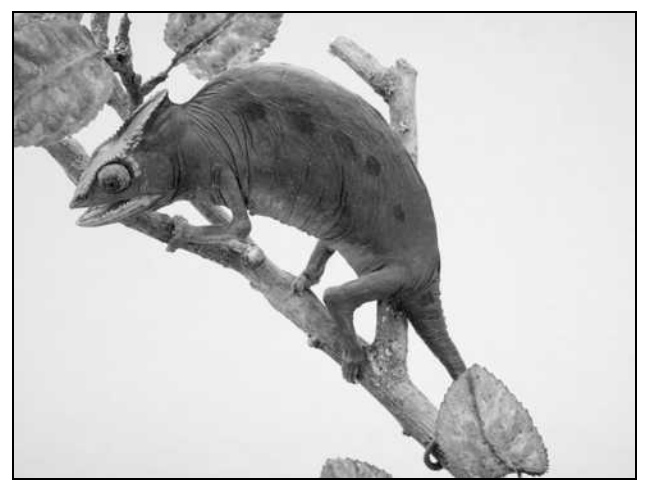
Figure 2 . Stuffed adult Chamaeleo cristatus from Gabon exhibited in the Museum of Zoology in Lausanne, Switzerland.

scales + one pored, enlarged femoral scale; on the right a continuous series of 19 pored, enlarged femoral scales; the left and right series of pored, enlarged femoral scales separated by a diastema of five poreless, enlarged precloacal scales. Subcaudals strongly widened. Hands and feet with basal webbing. Found at 20:00 under tree bark on the ground in a forest. New record for the Arboretum (Pauwels, 2016).