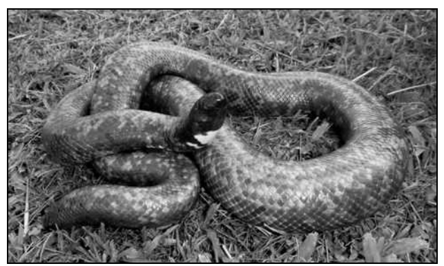
Figure 5 . Live Calabaria reinhardtii in Kango, Estuaire Prov., northwestern Gabon, showing its tail as a defensive display.