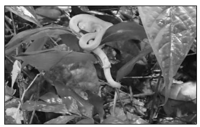
Figure 14. Atheris squamigera at a logging concession of the Compagnie Equatoriale des Bois, Ogooué-Lolo Prov.

One of us (EJN) photographed on 31 Oct. 2015 an adult individual in a SEEF logging concession (0°20'37.7"N, 10°22'50.2"E), about 2 km S of the southernmost point of the eastern part of the Monts de Cristal NP, Komo Dept, Estuaire Prov. (Figure 13). Its swollen belly indicates that it had ingested a large prey. New locality record (Pauwels et al., 2002). On 18 Nov. 2015 one of us (NT) encountered an individual in a forest (0°40'47.7"S, 13°30'30.0"E, alt. 508 m asl) in a Precious Woods concession in Mouloundou Dept near the easternmost point of Ogooué-Lolo Prov. (Figure 14). New dept record (Pauwels and Vande weghe, 2008).