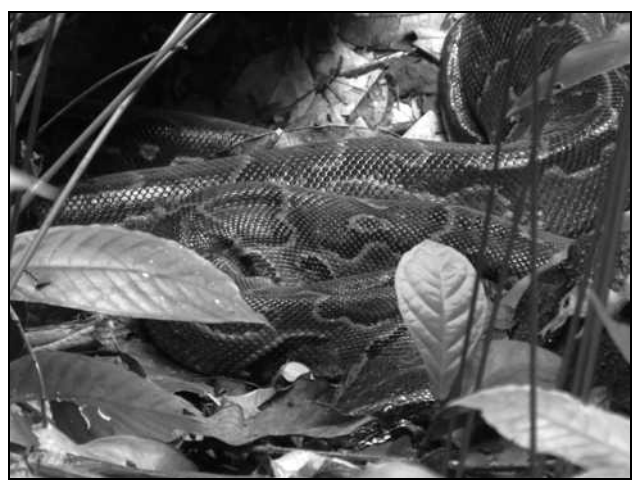
Figure 11 . Adult Python sebae in situ at a logging concession of the Société Equatoriale d'Exploitation Forestière, Estuaire Prov.

and David, 2008, providing a morphological description of MNHN 1886.224-226). The common French name boaedon périforestier proposed by Trape and Mediannikov (2016) can be translated into English as "peri-forest house snake."