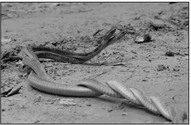
Figure 9. Combat between two adult male Dendroaspis j. jamesoni at Biboulou in Woleu-Ntem Prov., northeastern Gabon.