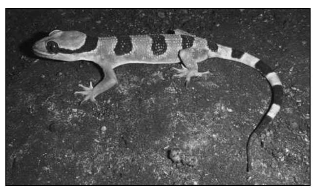
Figure 2. Live adult Hemidactylus fasciatus in Youmbidi Cave, Ogooué-Lolo Prov.

mid-August in captivity, allowing a confirmation of their specific identity. The species is thus currently recorded from three caves in this dept ( Pauwels et al., 2017; Figure 2 above). Egg deposition by geckos in caves had not been recorded previously in Gabon.