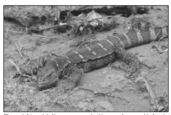
Figure 4 . Live adult Varanus ornatus basking on a forest road in Lopé Dept, Ogooué-Ivindo Prov.

On 29 Jan. 2015 one of us (CR) photographed an adult individual basking on an old overgrown road in secondary forest (0°19'19.5"N, 12°34'00.9"E) in Lopé Dept of Ogooué-Ivindo Prov., less than one km W of Ivindo NP (Figure 4). New locality record (Pauwels and Vande weghe, 2008). Mindonga-Nguelet et al. (2016) reported an observation of the species (under V. niloticus and V. nititicus [sic]) from a swampy clearing, the "Baï de Momba," in Sébé-Brikolo Dept of Haut-Ogooué Prov. The ornate monitor had not yet been recorded from this dept (Pauwels and Vande weghe, 2008; Pauwels, Le Garff et al., 2016).