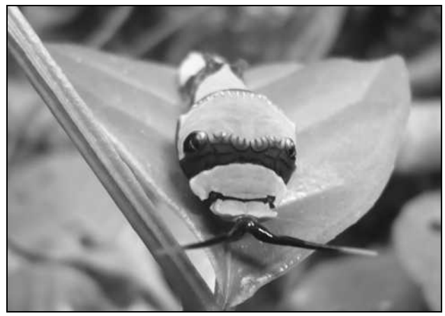
Figure 6 . Caterpillar of Papilio demodocus (Papilionidae) in defensive display on Bende Islet, Ogooué-Maritime Prov., southwestern Gabon.

nophis aethiopissa aethiopissa and R. batesii (Boulenger, 1908). To a lesser extent it is also reminiscent of Thelotornis kirtlandii (Hallowell, 1844), including by its horizontally elliptical "pupil" and its black furcated "tongue" with reddish tips (although these colors are inverted in the tongue of the latter snake, see Pauwels and Vande weghe, 2008: Fig. 243). The tongue of R. a. aethiopissa is uniformly black (see front cover illustration of Pauwels and Vande weghe, 2008). The tongue of H. smaragdinus found in the area is dark bluish (OSGP, pers. obs.).