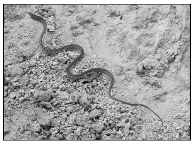
Figure 7 . Live adult Rhamnophis aethiopissa aethiopissa in Mayumba, Nyanga Prov., southeastern Gabon, inflating its neck as a defensive display. Photographer unknown.

In the morning of 26 Feb. 2010, one of us (OSGP) observed an adult individual on the jetty of Bende Islet in Ndogo Lagoon, Ndougou Dept, Ogooué-Maritime Prov. New record for the islet (Pauwels et al., 2006). About 20 meters away and a few minutes later, OSGP photographed a caterpillar of Papilio demodocus Esper, 1798 (Lepidoptera: Papilionidae) displaying a defensive behavior making it remarkably similar to a snake fore-body (Figure 6). Its leaf-green color with black bands and its large eye-like ocellae evoke three arboreal colubrids which are well known from the same area, Hapsidophrys smaragdinus , Rham -