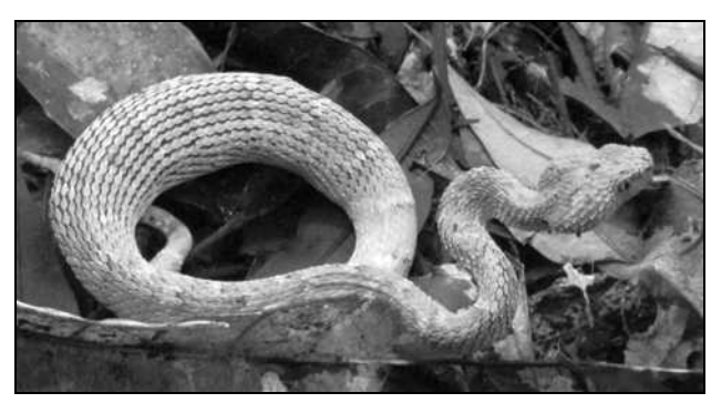
Figure 13. Adult Atheris squamigera at a logging concession of the Société Equatoriale d'Exploitation Forestière, Estuaire Prov.

One of us (EJN) photographed on 20 April 2016 an adult individual in a SEEF logging concession (0°20'37.7"N, 10°22'50.2"E), about 2 km S of the southernmost point of the eastern part of the Monts de Cristal National Park, Komo Dept, Estuaire Prov. (Figure 11). New locality record (Pauwels and Vande weghe, 2008). Figure 12 shows an adult individual killed after it had killed and eaten on 5 Dec. 2012 a calf of the N'dama cattle breed (Cetartiodactyla: Bovidae: Bos taurus Linnaeus, 1758) at Siat Nyanga Ranch, Mougoutsi Dept, Nyanga Prov. Another photo of an adult python killed after it ate a calf in the ranch was presented by Anonymous (2010). Predation by pythons on calves is a frequent issue in Nyanga Ranch, which used to offer a financial reward to employees who killed a python, lower if the python was found to have already eaten a calf (Anonymous, 2007a). Employees were encouraged to eat pythons as well (Anonymous, 2007b). Seba's python was not recorded from Nyanga Prov. by Pauwels and Vande weghe (2008), but was later recorded from two districts within the province, Haute-Banio (Pauwels, 2010) and Mougoutsi (Anonymous, 2010; Figure 12). It is to be noted that Cooke (2012)