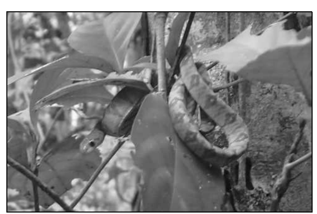
Figure 8 . Live adult Toxicodryas pulverulenta in the southern part of Ivindo National Park, Ogooué-Lolo Prov.

An adult individual was photographed by one of us (NT) on 11 Dec. 2016 in a forest (0°10'22.7"S, 12°31'48.6"E, alt. 581 m asl) in Mouloundou Dept, Ogooué-Lolo Prov., within the southern part of Ivindo NP (Figure 8). New prov. record (Pauwels and Vande weghe, 2008). This species had been so far recorded only from the northern part of Ivindo NP in Ogooué-Ivindo Prov. (Carlino and Pauwels, 2015; Pauwels et al., 2017).