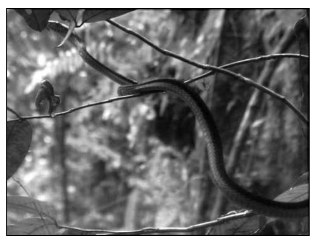
Figure 10. Dendroaspis j. jamesoni moving through a tree at a logging concession of the Société Equatoriale d'Exploitation Forestière, Estuaire Prov.