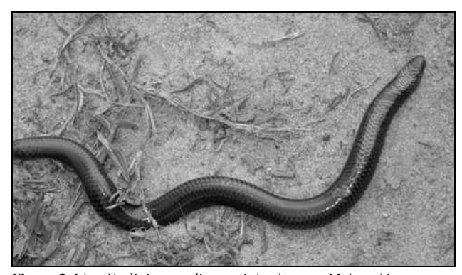
Figure 3 . Live Feylinia grandisquamis in situ near Mabounié, Moyen-Ogooué Prov.

In a report on a field survey of blood-sucking arthropods of the caves located in the surroundings of Lastoursville, Mouloundou Dept, Ogooué-Lolo Prov., Obame Nkoghe (2013: 13) provided a photograph of a gecko taken in "Siyou 2" cave. They did not identify the species, but its light brown dorsal color, red eyes, and the three dark brown saddle-shaped blotches on the dorsum between the fore and hind-limb insertions with white tubercles on the blotches' edges allow us to unambiguously identify it as Hemidactylus fasciatus . In the same dept, one of us (LC) observed an adult individual and a clutch of two eggs in Mbera Cave (Grotte de Mbera; 0°54'49.3"S, 12°50'21.2"E) on 10 July 2015. The eggs had been laid on the bat guano covering the floor of the cave, 7 m in from the entrance. They hatched in