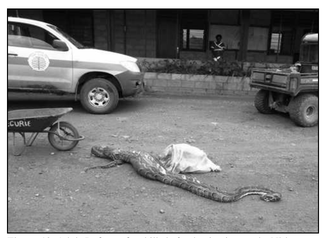
Figure 12 . Adult Python sebae killed after having ingested a N'dama calf ( Bos taurus ) at Siat Nyanga Ranch, southwestern Gabon.

documented a case of predation by a Seba's python on a Red-capped Mangabey (Primates: Cercopithecidae: Cercocebus torquatus (Kerr, 1792)) in Setté Cama, Ogooué-Maritime Prov., southwestern Gabon. Two interesting photos of a male–male ritual combat taken in 2011 in Wonga-Wongué Presidential Reserve were published by Vande weghe (2012: 124-125). The combat took place at around 5 P.M. in June (i.e., just before the long dry season), in the tall grass of a savanna, with an adult female staying at proximity of the two males. The site was located just near a gallery forest, a few km W of "Vallée morte" (J. P. Vande weghe, pers. comm., Dec. 2016).