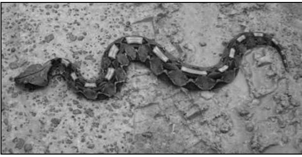
Figure 14. Young Bitis gabonica near Makabana, Nyanga Prov., southwestern Gabon.