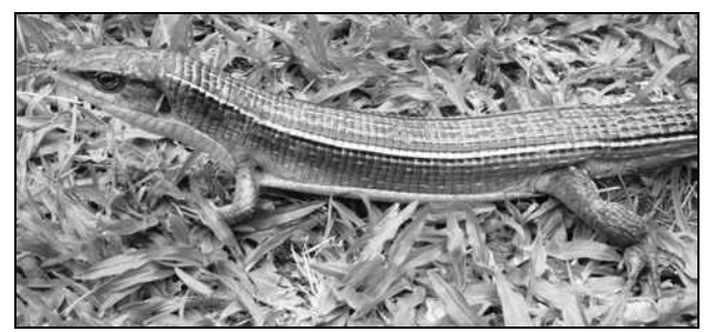
Figure 1 . Live adult Gerrhosaurus nigrolineatus in Angondjé, Estuaire Prov., Gabon.

New photographic material was identified based on the keys provided by Pauwels and Vande weghe (2008). Abbreviations: