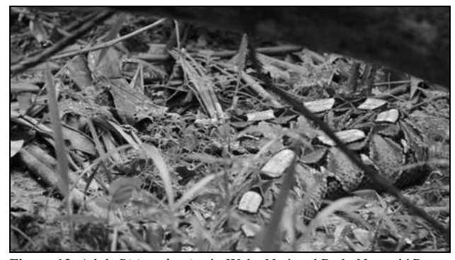
Figure 13 . Adult Bitis gabonica in Waka National Park, Ngounié Prov., Gabon.

On 3 Dec. 2016 one of us (CO), while cutting grass in a savanna between Mabanda and the Congolese border to give more visi-