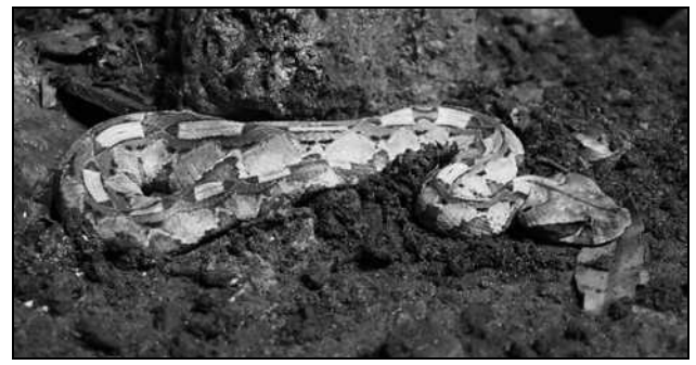
Figure 12 . Live Bitis gabonica in Mbera cave, Ogooué-Lolo Prov., Gabon.

bility to a camera trap designed to photograph wildlife, accidentally injured a Puff Adder with a machete (Figure 11). This locality is situated in Doutsila Dept, Nyanga Prov. New dept record. This savanna species is localized in Gabon, and had been recorded to date only near Moukalaba-Doudou NP in the villages of Mourindi and Loango, Nyanga Prov. (Pauwels et al., 2012) and in Djouori-Agnili and Passa Depts in Haut-Ogooué Prov. (Pauwels and Sallé, 2009).