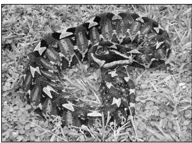
Figure 18. Adult Bitis nasicornis near Ngélié Lake, Wonga-Wongué Presidential Reserve, northwestern Gabon.