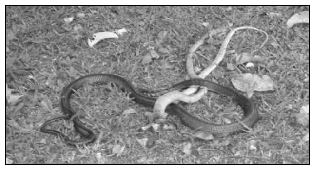
Figure 6 . Adult Naja melanoleuca with a dead adult female Toxicodryas blandingii it regurgitated near Gamba, Ogooué-Maritime Prov., southwestern Gabon.

On 20 March 2017 in a house garden in Yenzi, Gamba, Ogooué-Maritime Prov., an adult individual was disturbed by one of us