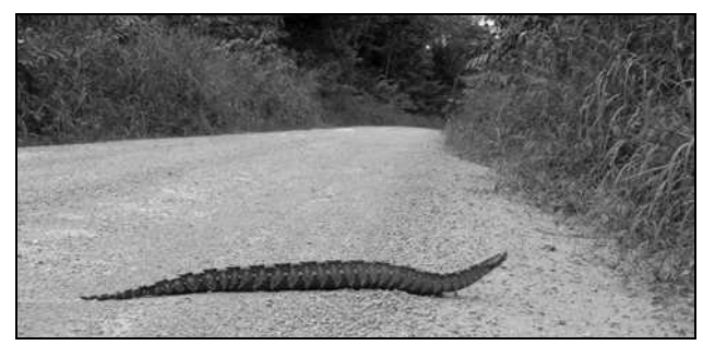
Figure 15. Adult Bitis nasicornis crossing a road near Mbomo, Ogooué-Ivindo Prov., northeastern Gabon.

New dept record (Pauwels and Vande weghe, 2008). On 1 April 2014, during a rainy early afternoon, LC photographed a young individual crossing the road between Makabana and Penioundou, Mougoutsi Dept, Nyanga Prov. (Figure 14). New prov. record (Pauwels and Vande weghe, 2008). LC examined three individuals killed for food consumption in Tchad 2, about 40 km ESE of Lambaréné, Ogooué & Lacs Dept, Moyen-Ogooué Prov., on 6 April, 13 May and 12 August 2012, respectively. New prov. record. With the two present new prov. records, the species is currently known from all provinces of Gabon (Pauwels and Vande weghe, 2008). Two individuals were illustrated by Le Garff (2015: 25) under the name B. gabonica. The photograph on the left was taken in Franceville, Haut-Ogooué Prov., the one on the right shows a captive individual in the "Terrarium & Vivarium de Kerdanet" in Plouagat, France (Le Garff, pers. comm. to OSGP, 2016). The individual illustrated on the latter photograph shows a single black triangle on the head side posterior to the eye, and is actually a B. rhinoceros (Schlegel, 1855), a West African species absent from Gabon.