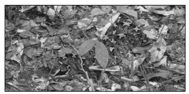
Figure 16 . Adult Bitis nasicornis in the southern buffer zone of Mwagna National Park, Ogooué-Ivindo Prov., northeastern Gabon.

ual in the southern buffer zone (0°15'50.4"N, 13°47'16.6"E) of Mwagna NP in Ogooué-Ivindo Prov. (Figure 16). New record for the NP. With Dipsadoboa viridis (see above), this is only the second reptile species recorded from Mwagna NP, which was never herpetologically investigated (Vande weghe et al., 2016) but which probably houses a rich herpetofauna. On 24 July 2013 LC examined an adult individual killed by a villager along Ngou River (2.27555°N, 11.51451°E), Ntem Dept, Woleu-Ntem Prov. New dept record (Pauwels and Vande weghe, 2008). On 23 Dec. 2015 at around 11 A.M. a juvenile individual (Figure 17) was found by LC in Ayémé (0.31366°N, 9.66248°E), Komo-Mondah Dept, Estuaire Prov. It was hidden under a piece of dead wood in highly degraded secondary forest. New locality record (Pauwels and Vande weghe, 2008). During a heavy rain on 5 March 2016 at noon, LC photographed an adult individual near Lac Ngélié (Ngélié Lake; 0.67228°S, 9.42395°E) in Wonga-Wongué Presidential Reserve (Figure 18). New locality record (Pauwels, 2016; Pauwels and Vande weghe, 2008).