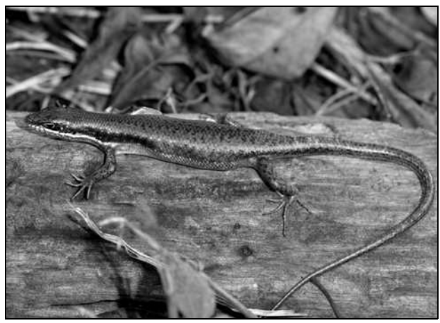
Figure 4 . Adult Trachylepis maculilabris in Mitzic, Woleu-Ntem Prov., northern Gabon.