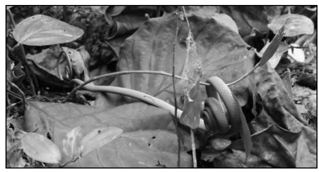
Figure 5 . Adult Dipsadoboa viridis in the buffer zone of Mwagna National Park, showing the typical spiral-shaped defensive display of the species.

See the account for Python sebae below and Figure 8, mentioning the use of the fat of the ornate monitor in Mbouda, Nyanga Prov., for traditional Punu medicine. The latter locality represents a new dept record (Pauwels and Vande weghe, 2008). Dewynter et al. (2017) reported (under V. niloticus ) an individual killed for food consumption in Bikourou village, thus in