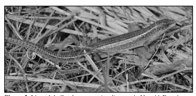
Figure 2 . Live adult Gerrhosaurus nigrolineatus in Nyonié, Estuaire Prov., Gabon.

dead-on-road individual on the "colline de Tchad" (Tchad hill;