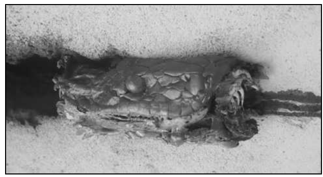
Figure 7 . Head of a Python sebae kept for traditional use in Mbouda, Nyanga Prov., southwestern Gabon.

(DR) while it had already swallowed 90% of an adult female Toxicodryas blandingii . The prey, of a length comparable to that of its predator (see Figure 6), was regurgitated by the cobra. This represents a new prey record for the black and white cobra, known to have a very eclectic diet (Pauwels and Vande weghe, 2008).