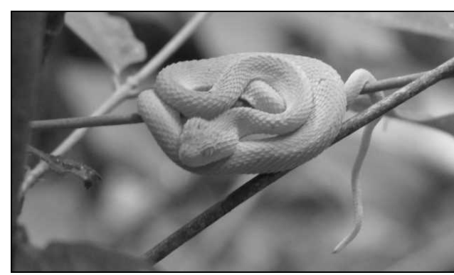
Figure 10 . An orange Atheris squamigera in southern Ivindo National Park.