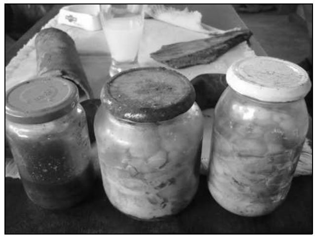
Figure 8 . Jars containing fat of Python sebae and Varanus ornatus used for traditional medicine in Mbouda, Nyanga Prov., southwestern Gabon.