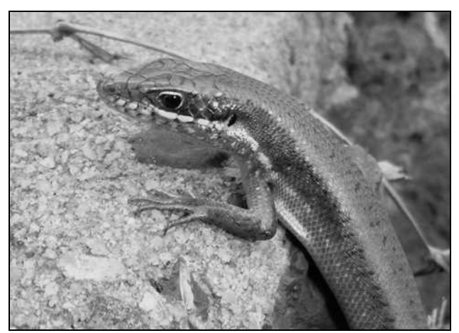
Figure 3 . Adult Trachylepis maculilabris in Bitam, Woleu-Ntem Prov., northern Gabon.

0.96988°S, 10.48519°E), where the N1 road crosses a secondary forest, Tsamba-Magotsi Dept, Ngounié Prov. Secondary forest is an unusual place to find this savanna-dwelling species, but it is possible that, like Agama picticauda , it utilizes roads to colonize new areas (Pauwels and Vande weghe, 2011). New prov. record (Pauwels and Vande weghe, 2008).