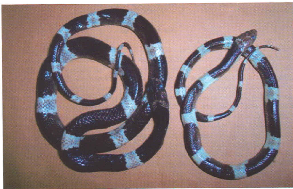
Figure 2. Dorsal view of the holotype of Lycodon cardamomensis (right) from Cambodia and IRSNB 16549 from Thailand. Note the change of colouration due to preservation (compare with Fig. 1).