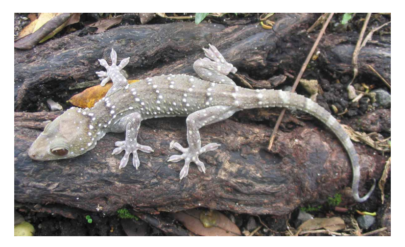
FIGURE 2. Holotype of Gekko nutaphandi sp. nov. in life. Note the pale dorsal coloration.

Body robust, trunk relatively long (TrunkL/SVL ratio 0.39), dorsoventrally depressed in cross-section, with small but distinct ventrolateral folds without denticulate margins. Dorsal scales heterogeneous, granular, rectangular to oval, flattened; regularly arranged, small (5-6 times size of granules), conical, posteriorly-directed tubercles extending from posterior margin of orbit to tail; tubercles much smaller on parietal region than elsewhere, larger on mid-flanks than middorsally or on ventral flanks; tubercles in 14 rows at midbody. Ventral scales smaller than dorsal tubercles, subimbricate; somewhat larger on abdomen than on chest, becoming granular and much smaller in gular region; midbody scale rows across belly to ventrolateral folds 31. Slightly enlarged precloacal scales in a single row of 22, pitted but without pores, in a pale, sharply con-