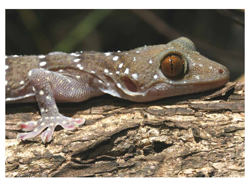
FIGURE 4. Lateral view of head of Gekko nutaphandi sp. nov. illustrating the brick red eye color and large ear opening of this species.

Fore- and hindlimbs moderately long, stout; forearm and tibia moderately long (ForeaL/SVL ratio 0.15; CrusL/SVL ratio 0.19); digits relatively short, digit I, both manus and pes, clawless, all remaining digits