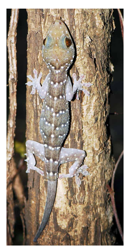
FIGURE 3. Adult specimen (not collected) of Gekko nutaphandi sp. nov. in life illustrating bolder dorsal coloration than the holotype and showing the brick red iris typical of this species.

trasting row. Scales on palm and sole smooth, flat, rounded; scales on dorsal aspects of hind limbs heterogeneous – granular, intermixed with larger tubercules, some conical, others flattened with a small distal point at distal scale margin; scales on dorsal surface of forelimb proximal to elbow subimbricate, weakly heterogeneous, those distal to elbow granular intermixed with larger oval to triangular tubercles.