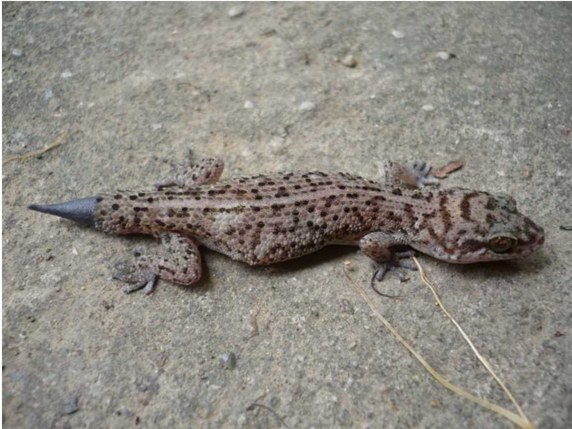
FIGURE 10. Live adult Dixonius siamensis (tail autotomized, partly regenerated) photographed in situ in Cha-am Forest Park, Cha-am District, Phetchaburi Province, western Thailand.