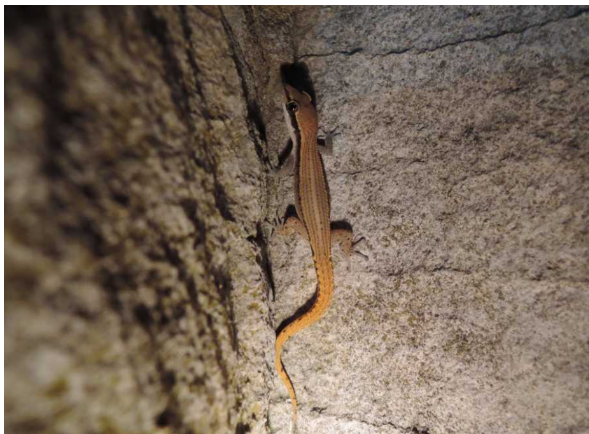
FIGURE 9. Live adult Dixonius melanostictus (tail original) photographed in situ in Muak Lek District, Saraburi Province, central Thailand.