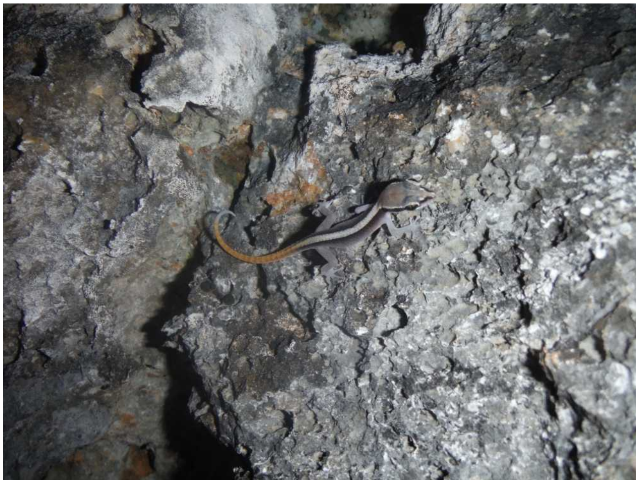
FIGURE 6. Live subadult Dixonius kaweasaki sp. nov. in situ (individual not collected).

number (12 or 13 vs. 10 or 11). From D. minhlei it differs by its slightly smaller size (maximum SVL 41.6 vs. 47.5 mm), its higher SL number (10 or 11 vs. 7–9), lower DorTubR number (12 or 13 vs. 14 or 15), higher Ven number (24 vs. 20–23), and its higher number of precloacal pores in males (9–11 vs. 7 or 8). From D. siamensis it differs by its much smaller size (maximum SVL 41.6 vs. 57 mm), higher SL number (10 or 11 vs. 7 or 8), and higher number of precloacal pores in males (9–11 vs. 6 or 7). It is distinguished from D. taoi by its higher SL number (10 or 11 vs. 7 or 8), higher Ven number (24 vs. 21–23), higher SubLT4 (15 vs. 12–14) and higher number of precloacal pores in males (9–11 vs. 5 or 6). From D. vietnamensis it differs by its higher SL number (10 or 11 vs. 7), higher Ven number (24 vs. 20), generally lower DorTubR number (12 or 13 vs. 13–17) and higher SubLT4 (15 vs. 13). Phyllodactylus burmanicus shows 6 SL, 6 IL, 8 or 9 SubLT4, 7 precloacal pores and a maximum known SVL of 35 mm (Annandale 1905a–b). Phyllodactylus paviei shows 8 SL, 6 precloacal pores and a maximum known SVL of 46 mm (Mocquard 1904).