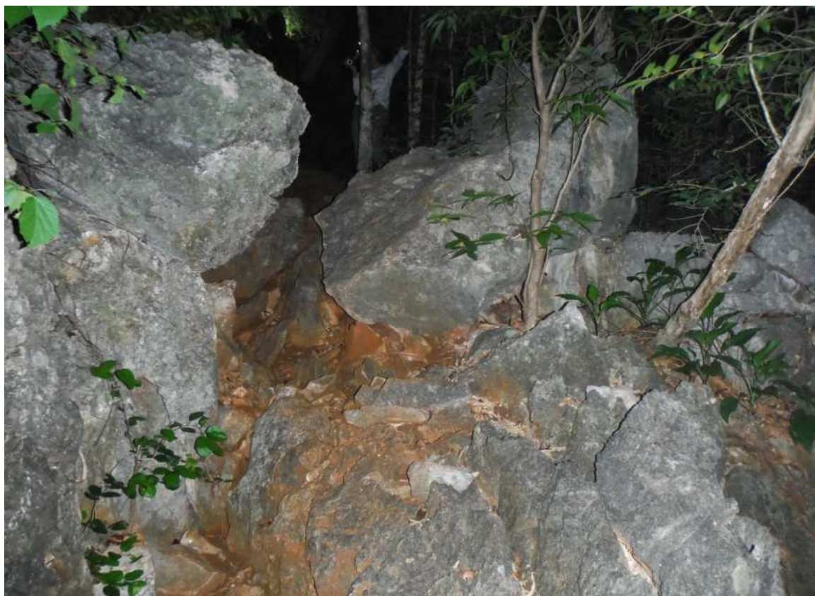
FIGURE 8. Microbiotope of Dixonius kaweesaki sp. nov. at the type locality.