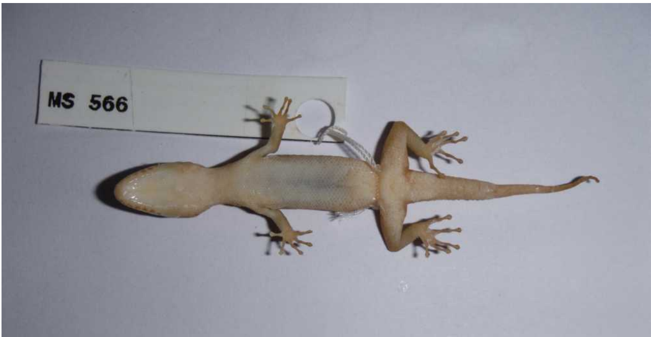
FIGURE 2. Preserved adult male holotype of Dixonius kaweasaki sp. nov. in ventral view.

Description of holotype. Adult male. SVL 41.6 mm. Head relatively long (HeadL/SVL ratio 0.31), wide (HeadW/HeadL ratio 0.62), not markedly depressed (HeadH/HeadL ratio 0.44), distinct from slender neck. Lores and interorbital region weakly inflated, canthus rostralis relatively prominent. Snout moderately short (SnOrb/HeadL ratio 0.35), rounded, longer than orbit diameter (OrbD/SnOrb ratio 0.84); scales on snout and forehead small, hexagonal to rounded, flattened, with smooth or slightly rugose surface, some conical; scales on snout larger than those on occipital region. Eye moderately large (OrbD/HeadL ratio 0.29); pupil vertical with crenelated margins; supraciliaries short, without spines. Ear opening oval, obliquely oriented, moderate (EarL/HeadL ratio 0.05); orbit to ear distance subequal to orbit diameter. Rostral about twice wider than high, two enlarged supranasals in broad contact; rostral in contact with supralabial I on each side, nostrils and both supranasals; nostrils round, each surrounded by supranasal, rostral, supralabial I and two postnasals. Mental triangular, as wide as deep; two pairs of enlarged postmentals, anteriormost approximately three times larger than posterior; each anterior postmental bordered anteriorly by mental, medially by other anterior postmental, anterolaterally by 1 st and