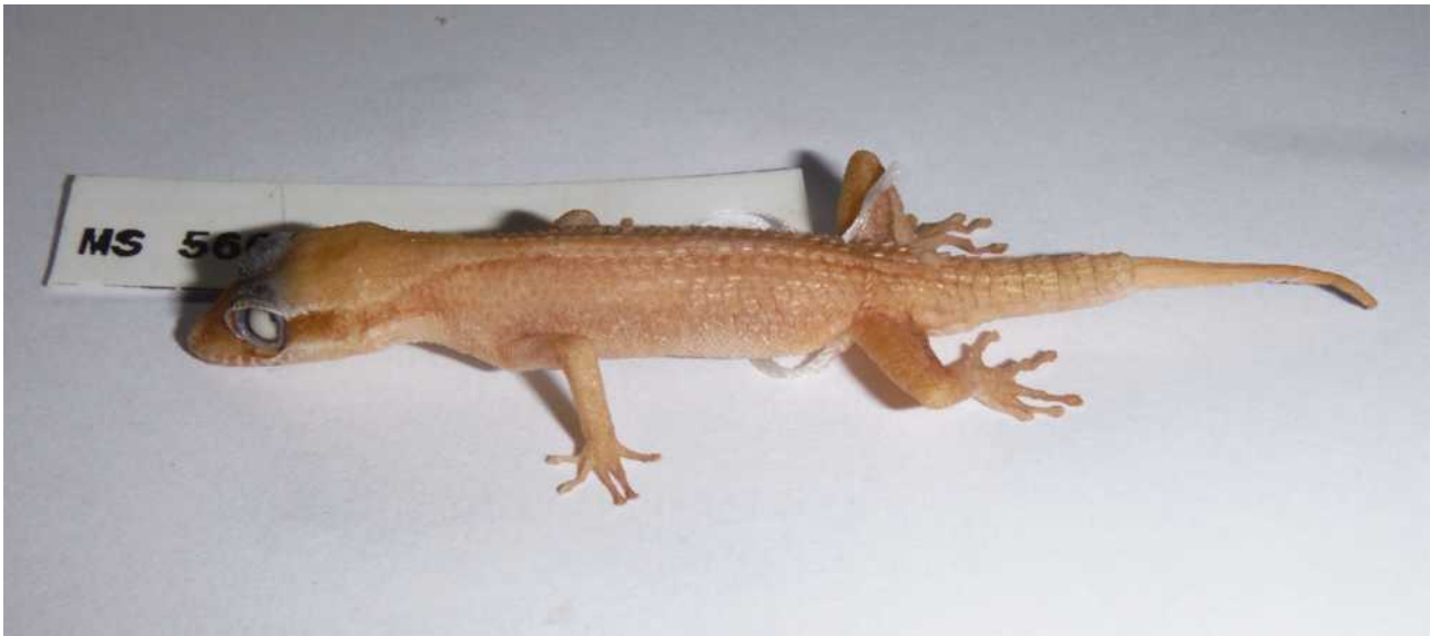
FIGURE 1. Preserved adult male holotype of Dixonius kaweasaki sp. nov. in dorsolateral view.