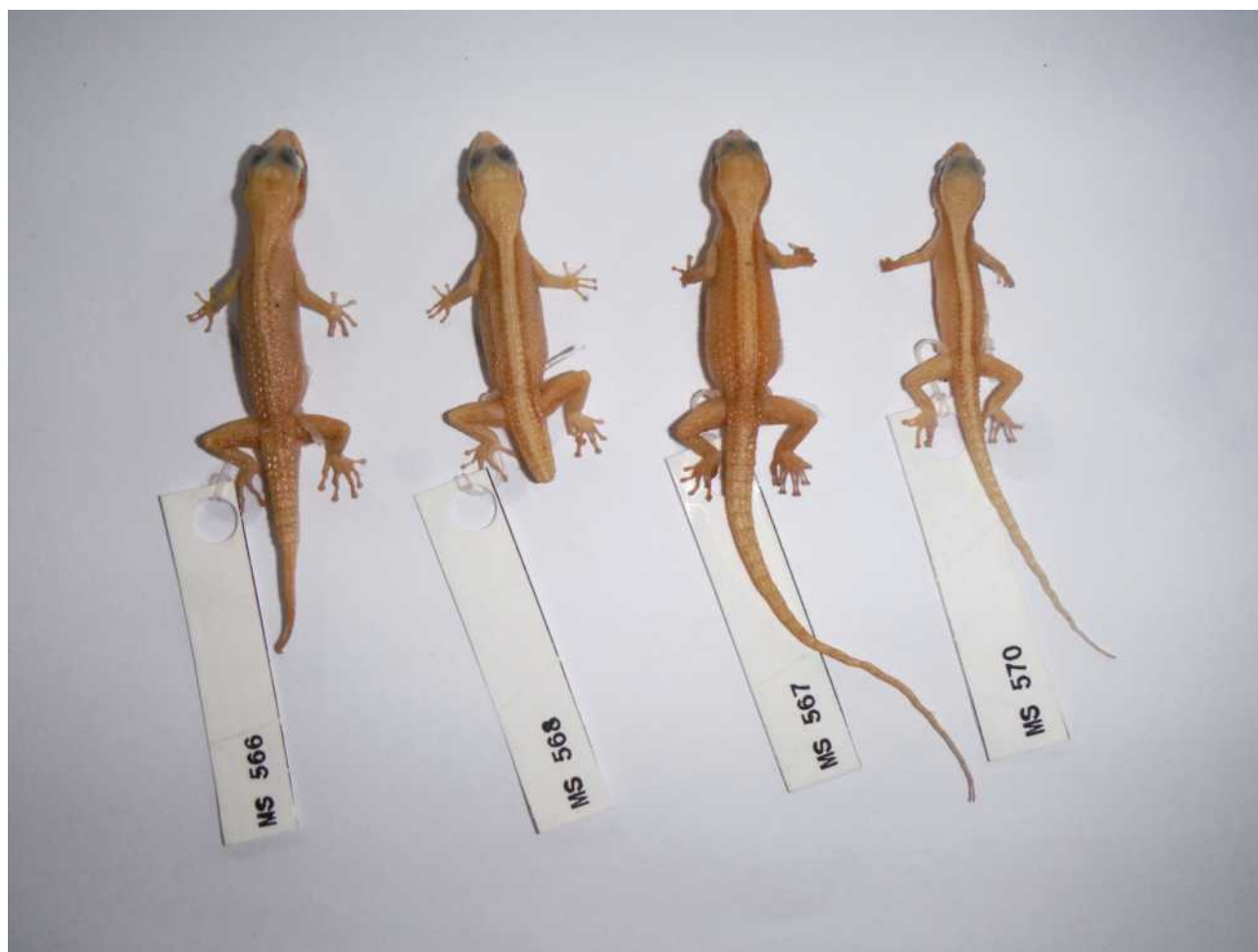
FIGURE 3. Preserved type series of Dixonius kaveesaki sp. nov.

2 nd infralabials; the pair collectively bordered posteromedially by a row of four throat scales. Supralabials to midorbital position 8/7; enlarged supralabials to angle of jaws 10/10. Infralabials 8/8. Interorbital scales 6. Body slender, elongate (AG/SVL ratio 0.42), without ventrolateral folds. Dorsal scales heterogeneous, small, irregular, flattened to conical scales distributed among large, strongly keeled subimbricate tubercles arranged in 12 or 13 more-or-less regular longitudinal rows at midbody; flanks covered with irregular smooth scales. Ventral scales smooth, imbricate; free margins rounded; increasing in size from throat to chest to abdomen, somewhat smaller in precloacal region; midbody scale rows across belly to lowest rows of tubercles, 24; gular region with relatively homogeneous, granular scales. Eleven precloacal pores in a continuous series; pore-bearing scales not enlarged relative to adjacent scale rows; scales in row immediately posterior to pore-bearing row 2 to 3 times size of other scales of cloacal region. No femoral pores or enlarged femoral scales.