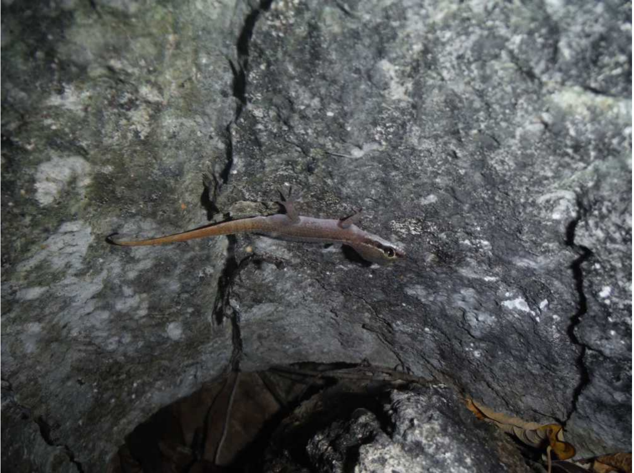
FIGURE 4. Live adult male Dixonius kaweesaki sp. nov. in situ (individual not collected).

stripes progressively turn into grey, then light gray and eventually become uniformly whitish as the belly and the throat. The upper surface of limbs, hands and feet is uniformly light gray. The vertebral whitish stripe is prolonged anteriorly by two thin stripes running through the temporal area above the postorbital black stripe and above the eye where the supraciliaries are whitish. Supralabials are grey with thin white vertical bars. The dorsal surface of the original part of the tail is light orange, with regularly arranged darker and lighter thin bands. In preservative the colors fade out, and are replaced by nuances of light brown and beige (compare live individuals of Figures 4–6 with the preserved holotype on Figure 1).