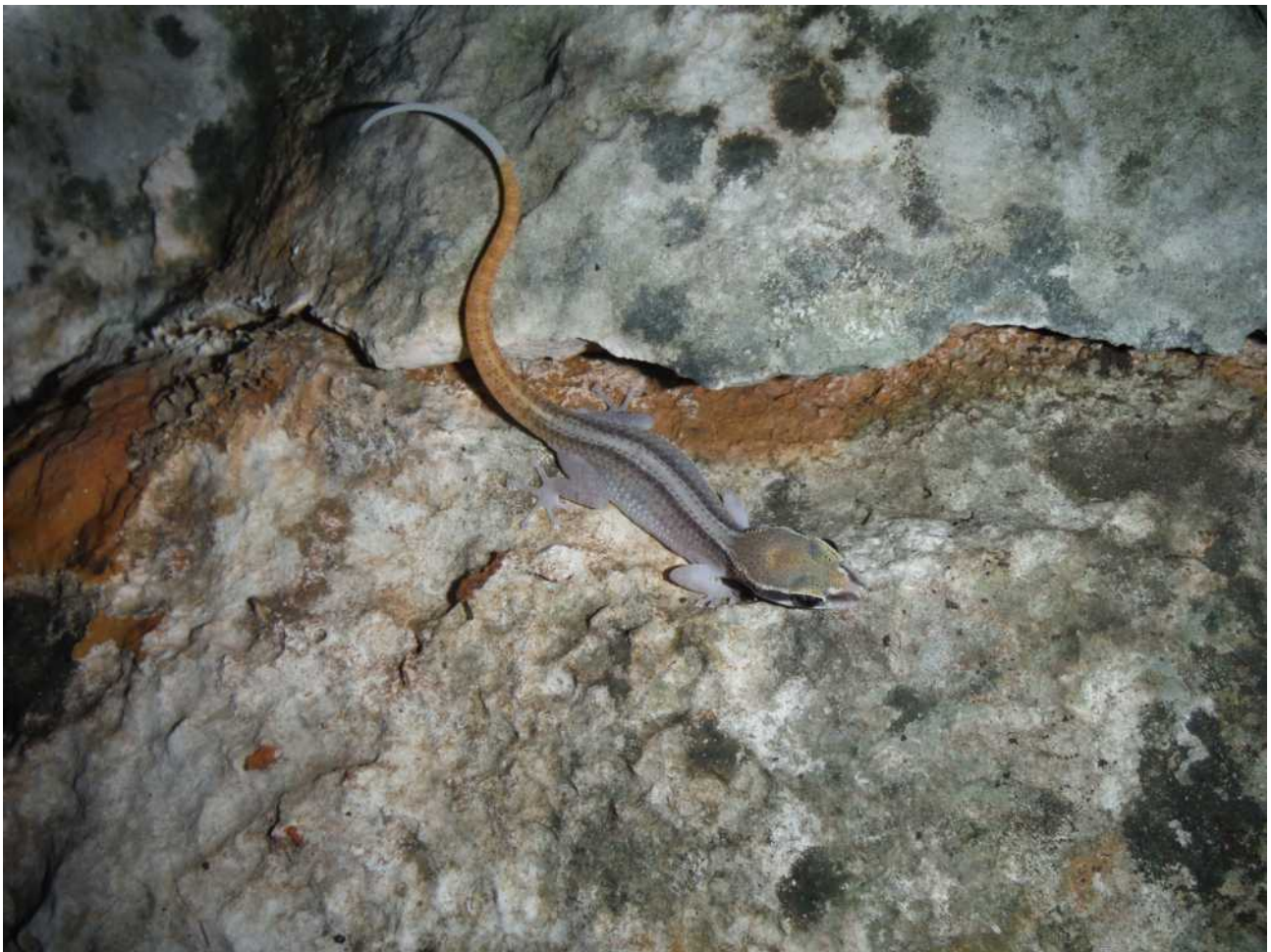
FIGURE 5. Live adult female Dixonius kaweesaki sp. nov. in situ (individual not collected). Note the partly regenerated tail.

Chaiyaphum, Chon Buri, Loei, Prachuap Khiri Khan, Sisaket and Udon Thani provinces illustrated by Manthey & Grossmann 1997, Chan-ard et al. 1999 and Taylor 1963), D. taoi and D. vietnamensis . The presence of a lateral wide dark stripe on the upper flanks distinguishes it from D. aaronbaueri (absence of stripes, bands or any pattern on dorsum), D. hangseesom (no dark dorsal stripe; see Figure 11), D. melanostictus (lateral wide dark stripe on the lower flanks, not on the upper flanks; see Figure 9 and individuals from Nakhon Ratchasima and Saraburi provinces illustrated by Taylor 1963 and Chan-ard et al. 1999), D. minhlei (no dark dorsal stripe), D. siamensis (no dark dorsal stripe), D. taoi (no dark dorsal stripe) and D. vietnamensis (no dark dorsal stripe). The presence of a vertebral stripe abruptly lighter than the upper flank background color is unique to Dixonius kaweesaki sp. nov. This latter contrast is most marked in young individuals where the vertebral stripe is white and the upper flank color is black. The drawings presented in the original description of Phyllodactylus paviei (Mocquard, 1904) from “Vatana (Siam)” and in a complement to the description of Phyllodactylus burmanicus Annandale, 1905a (Annandale 1905b) from “Tavoy”, both currently regarded as junior subjective synonyms of D. siamensis (Bauer et al. 2004), show a blotched dorsal pattern without dark stripes; they also both lack a dark canthal stripe.