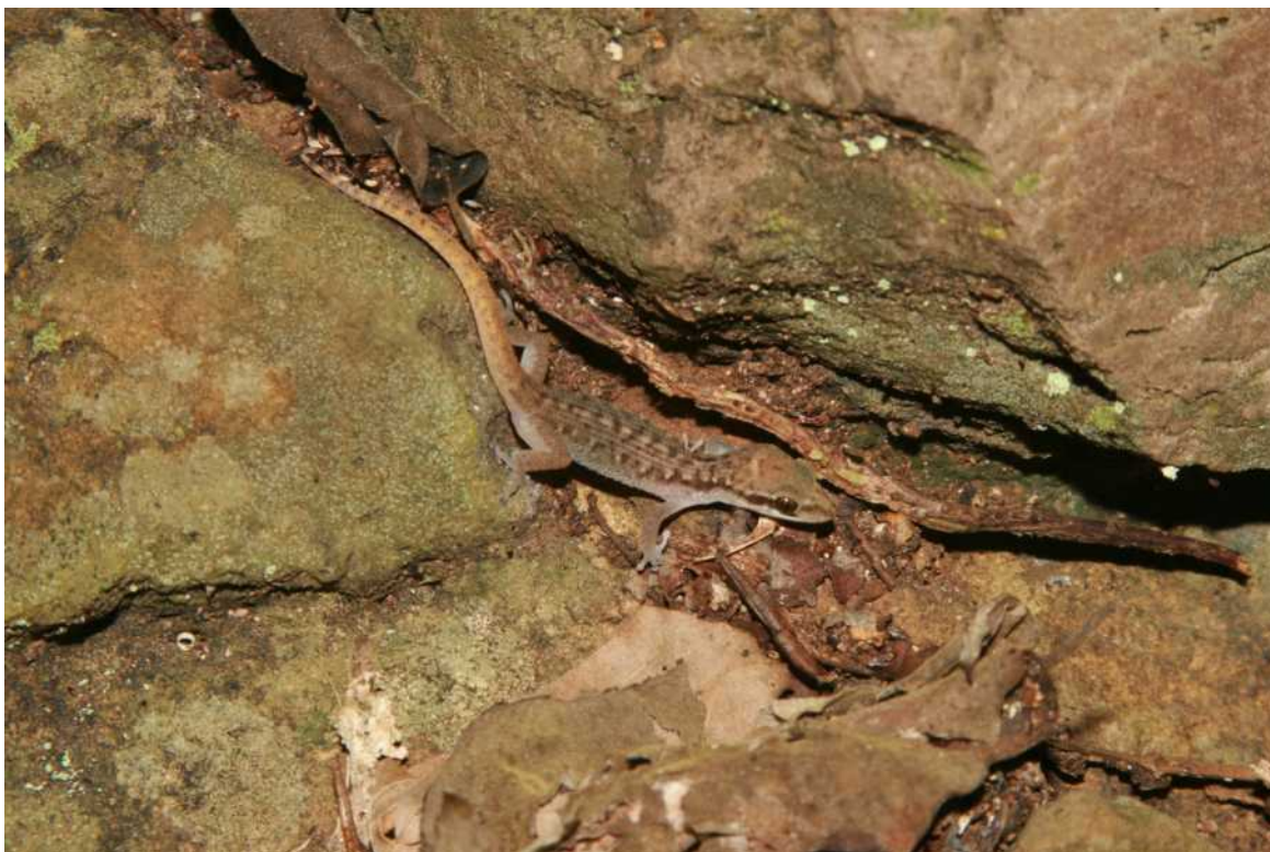
FIGURE 11. Live adult Dixonius hangseesom (tail original) photographed in situ in Sai Yok District, Kanchanaburi Province, western Thailand.