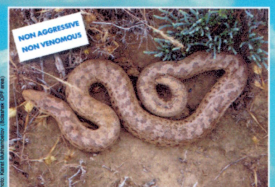
Eryx miliaris Dwarf Sand Boa (Brown phase) Maximal length about 70 cm. Pupil vertically elliptic.