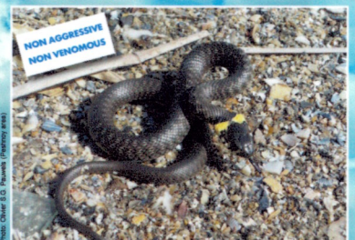
Natrix natrix Grass Snake Maximal length about 130 cm. Round pupil.