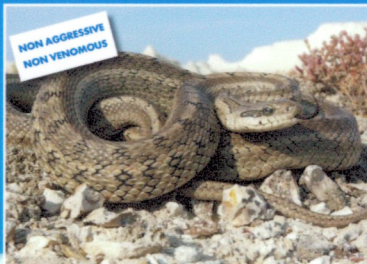
Elaphe dione Steppe Rat Snake Maximal length about 120 cm. Round pupil.