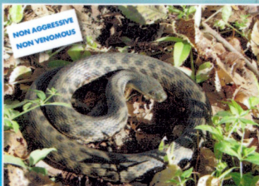
Natrix tessellata Dice Snake Maximal length about 140 cm. Round pupil.