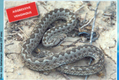
Vipera ursinii renardi Steppe Viper Max. length about 60 cm. Pupil vertically elliptic. Rarely severe effects, but potentially deadly.