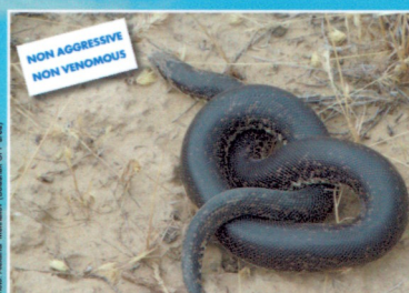
Eryx miliaris Dwarf Sand Boa (Black phase) Maximal length about 70 cm. Pupil vertically elliptic.