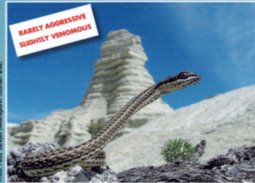
Psammophis lineolatus Steppe Ribbon Racer Maximum length about 100 cm. Round pupil. Bite causing usually only a small swelling.