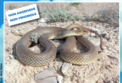
Dolichophis caspius Caspian Whip Snake Maximal length exceeding 200 cm. Round pupil.