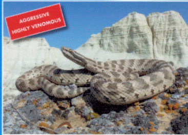
Gloydius halys caraganus Cape Karagan Pirviper Maximum length about 70 cm. Pupil vertically elliptic. Bite causing strong pain; potentially deadly.